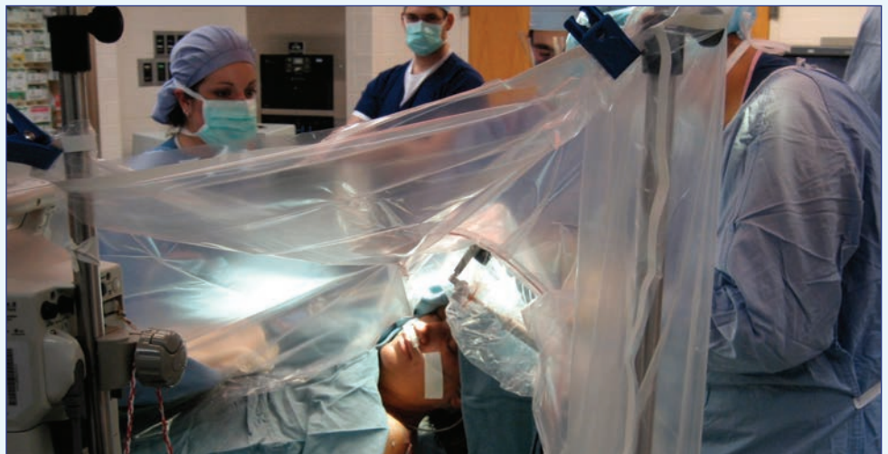
During an awake craniotomy, the patient is lightly sedated, providing feedback to neurosurgeons to help assess the extent of a tumor resection.

Potential benefits of operating on an awake and functioning brain reflect not only improved neurological outcomes, but an ability to more safely resect a greater amount of tumor which impacts overall survival. Awake craniotomies require cooperation from an experienced surgeon and anesthesiologist along with intraoperative guidance from the neurophysiology team to maximize success in achieving a relaxed and comfortable patient. This team approach is the key to our success in ensuring patient cooperation and allows us to push the boundaries for maximal amount of tumor resected while continuously assessing the patient to ensure no new deficits are occurring. •