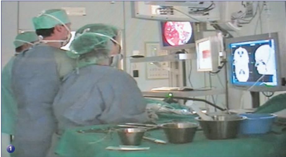
1 Camera view of surgical team in Maribor, Slovenia performing an endoscopic pituitary surgery.