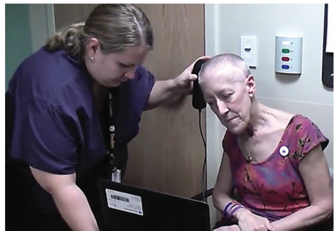
Figure 2. An RNS patient is shown how to download her brain recordings to a laptop computer.

In clinical trials, more than half of the patients treated with RNS had 50% or fewer seizures compared to their presurgical baseline. The median decrease in seizure frequency with treatment was 44% at 1 year, 53% at 2 years, and 60% or more in years 3 through 6. Since we began offering RNS at UPMC in January 2015, we have seen similar results in our patients. Importantly, this therapeutic modality returns to patients some degree of control over their disease, which we hope results in a significant improvement in their quality of life. Lastly, the ability to study chronic recordings in the epileptic brain, including responses to activity-triggered electrical stimulation, offers tremendous potential to further develop our understanding of the electrophysiological correlates of epilepsy and its treatment.